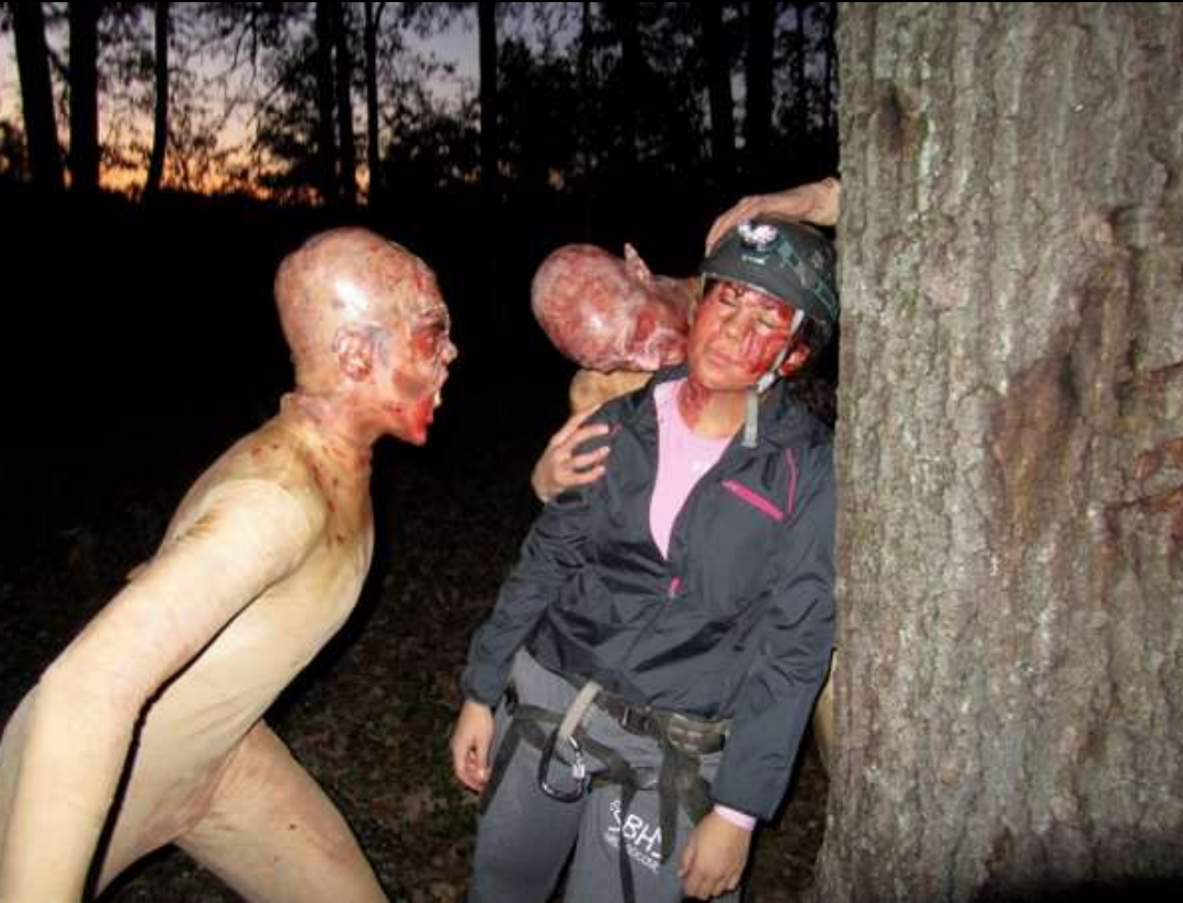
"Cave Scene"-( "The Descent" Re-enactment)