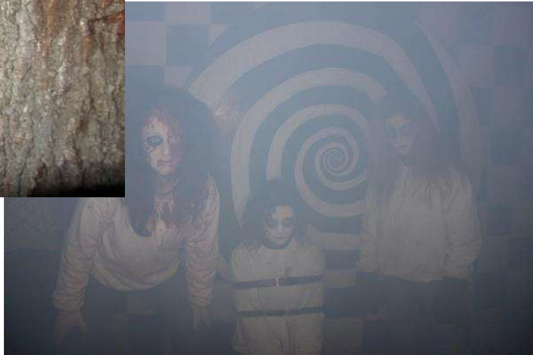
"Insane Asylum/Checkerboard Room"