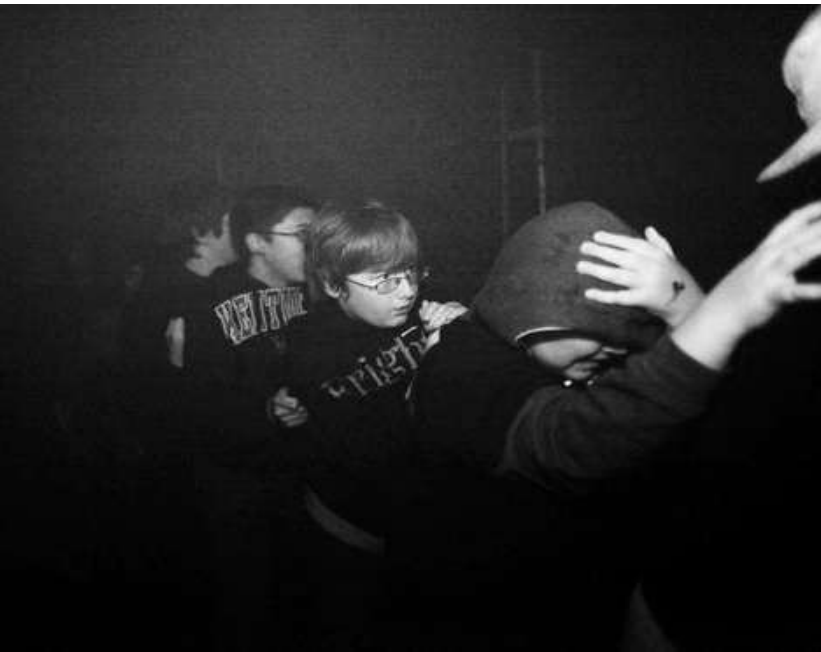
Reaching out Examples