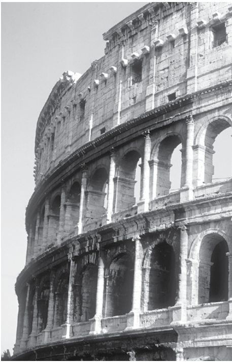
The Colosseum, a lasting icon of imperial Rome