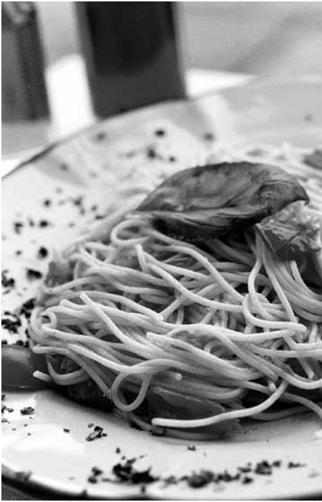
Pasta, basil and tomatoes—a simple yet authentic dish