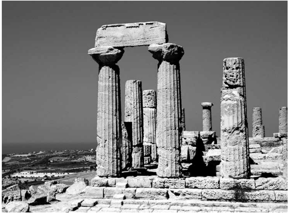
The Valley of the Temples in seaside Agrigento

massive Paradise Quarry and gardens, featuring the cave that Caravaggio dubbed “The Ear of Dionysius” for its unique acoustics. Also included is a visit to an ancient Roman amphitheater. Later, cross a bridge to the Island of Ortygia, where your guide leads a walking tour of this beautiful old city of Syracuse. Highlights include the 6th-century Temple of Apollo, the Duomo and the harbor-front fountain.