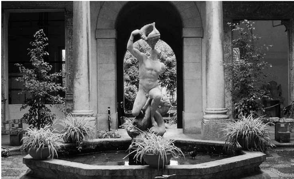
The elaborate artistry and greenery typical of Sicilian cities